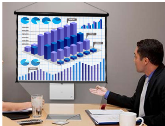
Screen can be wall mounted with a simple string

Unit D, 9/F., Century Centre, No.33-35 Au Pui Wan Street, Fotan, New Territories, Hong Kong Tel: 852-6210-0140 Fax: 852-8147-1900 E-mail: sales@mega-power.com Web site: www.mega-power.com